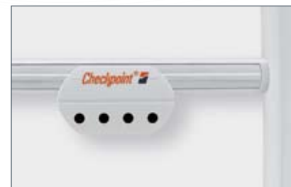
EVOLVE VisiPlus™ Unit