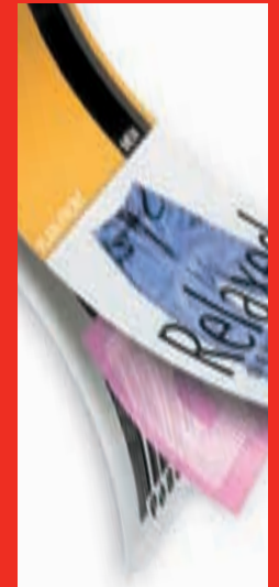
Check-Net Labeling Services

US Tel: 800 257 5540 or 856 848 1800 marketingleads@checkpt.com info@checkpt.com (For CheckPro Manager only)