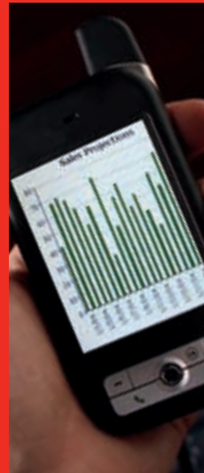
Shrink Management Software