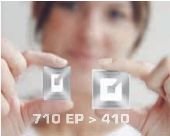
The 710 EP label outperforms standard 410 labels by 25 percent

EP labels deliver industry-changing advantages: