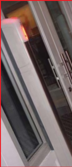
Electronic Article Surveillance

Checkpoint Systems is the leading supplier of shrink management solutions. Checkpoint's global team partners with retailers to reduce theft, increase inventory visibility and provide customers with greater merchandise availability through a combination of advanced RF technology, a broad merchandise protection program, added-value software and real-time labeling solutions.