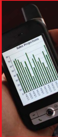
Shrink Management Software