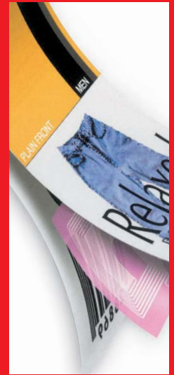
Check-Net® Labeling Services

CONTACT Tel.: 800 257 5540 E-mail: info@checkpt.com