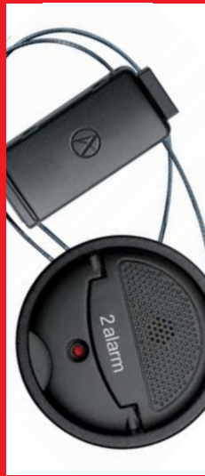
High Theft Solutions