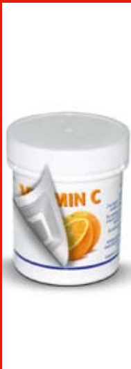
Labeling @ Source