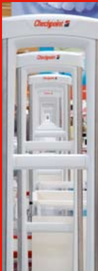
Electronic Article Surveillance

Checkpoint Systems is a global leader in shrink management, merchandise visibility and apparel labeling solutions. Checkpoint partners with retailers and their suppliers to reduce shrink, increase shelf availability, ensure labeling consistency and achieve operational excellence. Checkpoint's solutions enable retailers to enhance the shopping experience for consumers, and grow their businesses profitably.