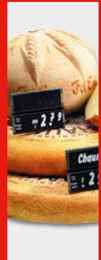
Retail Merchandising Solutions

U.S. Tel: 800 257 5540 or 856 848 1800 marketingleads@checkpt.com