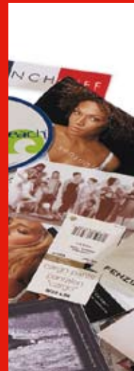
Apparel Labeling Solutions