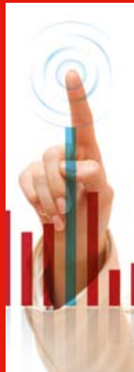
Shrink Management Software