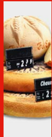
Retail Merchandising Solutions

CONTACT Tel: 800 257 5540 E-mail: info@checkpt.com