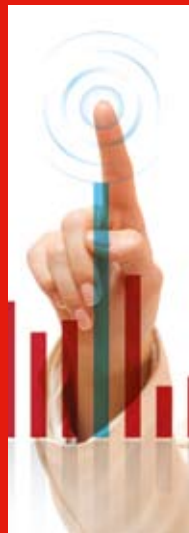
Shrink Management Software