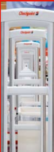
Electronic Article Surveillance

Checkpoint Systems is a global leader in shrink management, merchandise visibility and apparel labeling solutions. Checkpoint partners with retailers and their suppliers to reduce shrink, increase shelf availability, ensure labeling consistency and achieve operational excellence. Checkpoint's solutions enable retailers to enhance the shopping experience for consumers, and grow their businesses profitably.