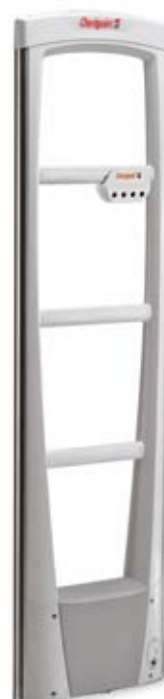
EVOLVE P10 antenna with integrated EVOLVE VisiPlus™ unit

The EVOLVE system, reflecting its name, is designed to evolve with a retailer's business. This highly extensible platform was engineered from its conception to provide a clear upgrade path to add new capabilities such as RFID, advanced networking, booster bag detection, and easy integration with other loss prevention systems.