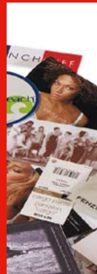
Apparel Labeling Solutions