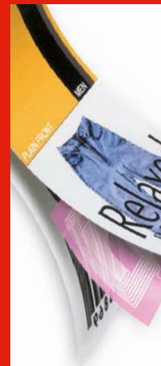
Check-Net Labeling Services

US Tel: 800 257 5540 or 856 848 1800 marketingleads@checkpt.com info@checkpt.com (For CheckPro Manager only)