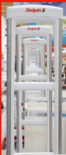
Electronic Article Surveillance

Checkpoint Systems is the leading supplier of shrink management solutions. Checkpoint's global team partners with retailers to reduce theft, achieve operational excellence, increase inventory visibility and provide customers with greater merchandise availability through a combination of advanced RF technology, a broad merchandise protection program, added-value software and real-time labeling solutions.