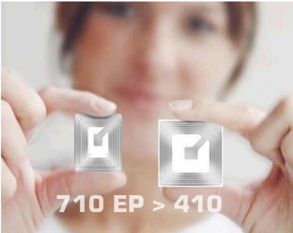
The 710 EP label outperforms standard 410 labels by 25 percent

EP labels deliver industry-changing advantages: