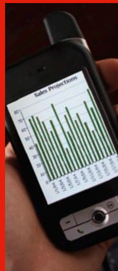
Shrink Management Software